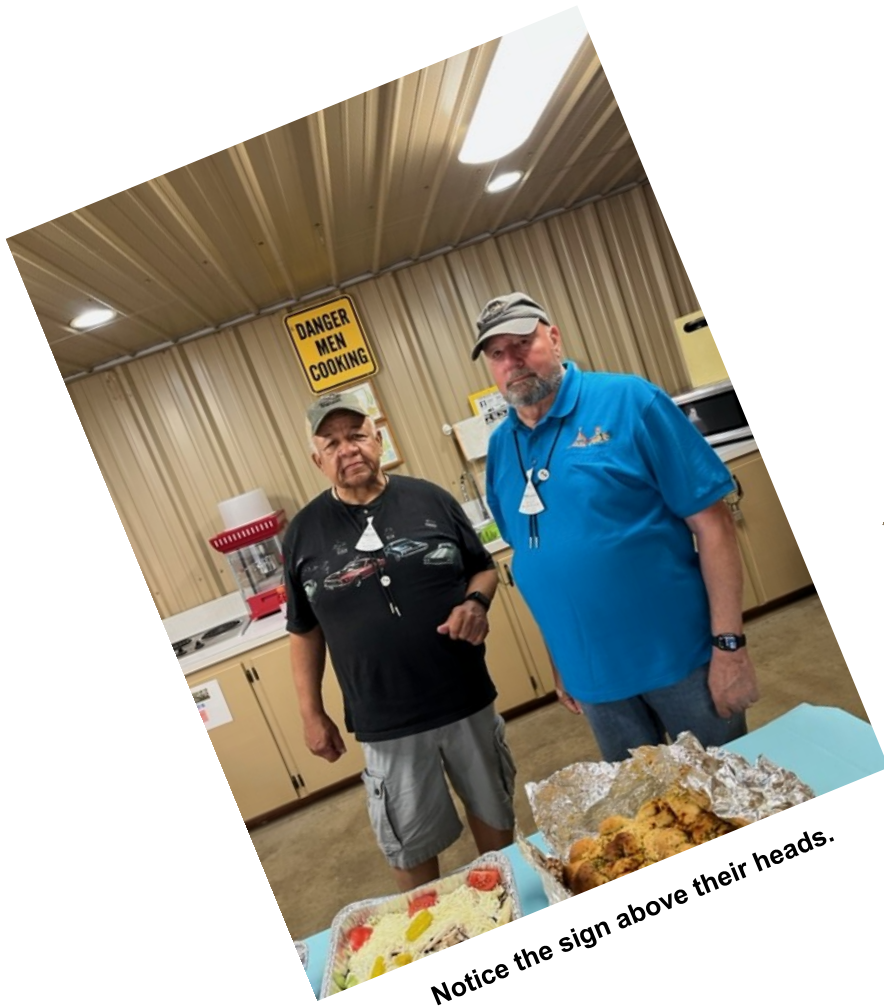
Notice the sign above their heads.