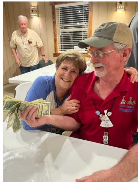
What's not to love about a guy bringing home the moolah?