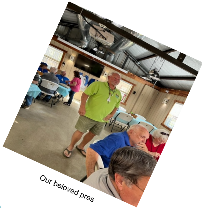
Our beloved pres