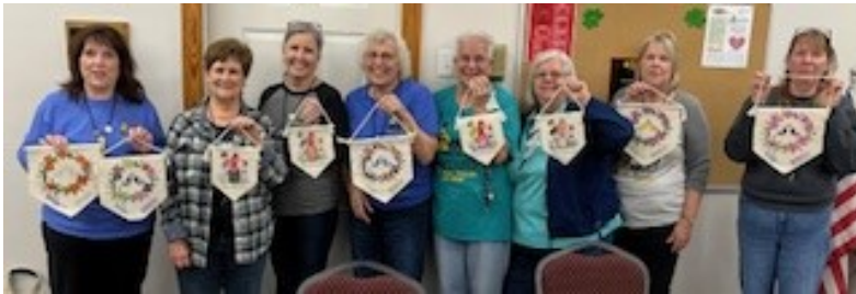
We are a bunch of talented ladies! Watch out world!