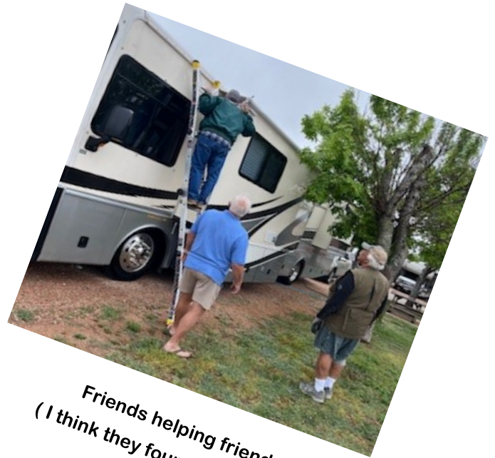
Friends helping friends! (I think they found Jimmy Hoffa)