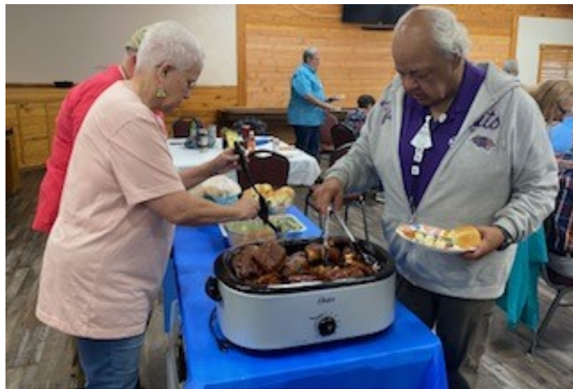
The ribs were a big hit! Fall off the bone goodness!