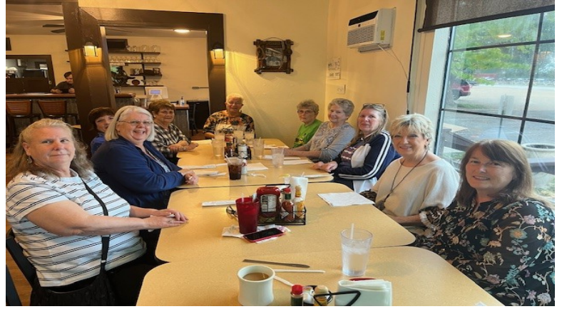
The guys went to breakfast at 7:30. The ladies countered by going at 9:00