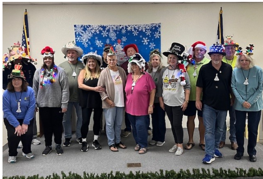
There was quite an array of Crazy Christmas Hats!